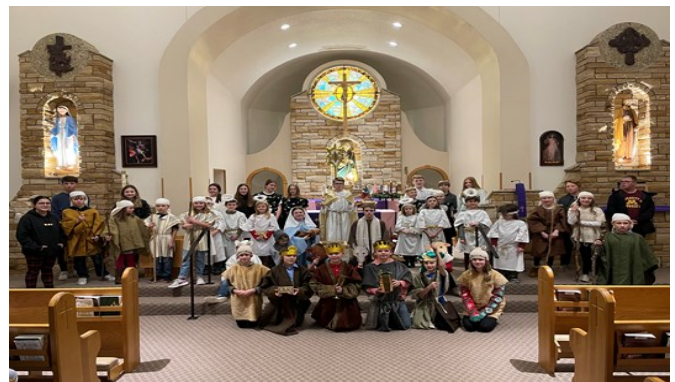
A job well done by the religion students at the Christmas Program 2021.

SAVE THE DATE: We are partnering with St. Wenceslaus Parish for the 2022 Totus Tuus (Totally Yours) on June 20-24 for the Kid's Program and June 19-23 for the Teen's Program. More info to follow.