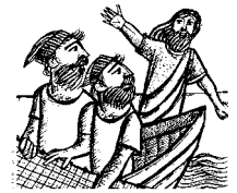
They left their nets and followed him