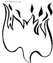
Come, Spirit of Wisdom

Received this week.....$ 835.00 Weekly budget requirement.....$ 1,070.00 Fuel Collection.....$ 300.00