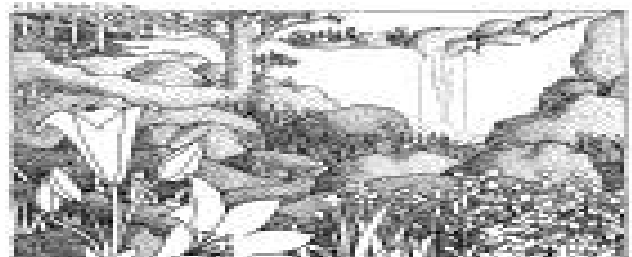
The Kingdom of Heaven is at Hand.