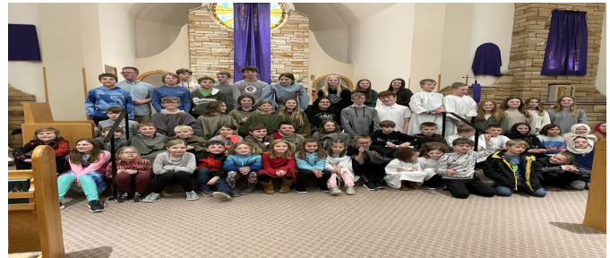
A job well done at the Holy Week/Easter Program on April 6, 2022.