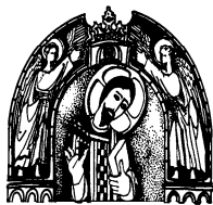
Everything written about me must be fulfilled