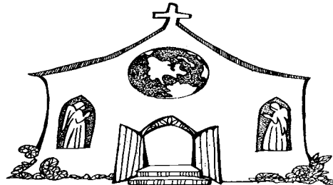
A HOUSE OF PRAYER FOR ALL PEOPLE © J. S. Paluch Co., Inc.